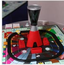
No Dice, No Money, No Cheating: New Monopoly