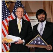
Ringmaster Pacquiao and His Traveling Circus