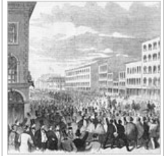
Disunion: Bayonets in Buffalo

Home | World | U.S. | N.Y. / Region | Business | Technology | Science | Health | Sports | Opinion | Arts | Style | Travel | Jobs | Real Estate | Autos | Back to Top Copyright 2010 The New York Times Company | Privacy | Terms of Service | Search | Corrections | RSS | First Look | Help | Contact Us | Work for Us | Advertise | Site Map