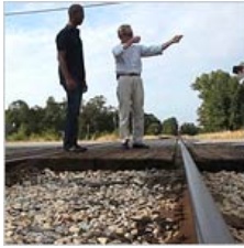
TV Series Tries to Revive Civil Rights Cold Cases