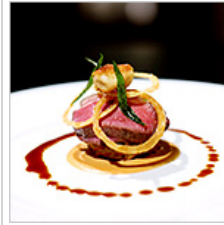
The Perfect Menu. Now Change It.